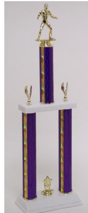
1 st Place Team Trophy

TEAM Trophies will also be awarded for 6U, 8U, 10U, 12U and 14U Divisions.